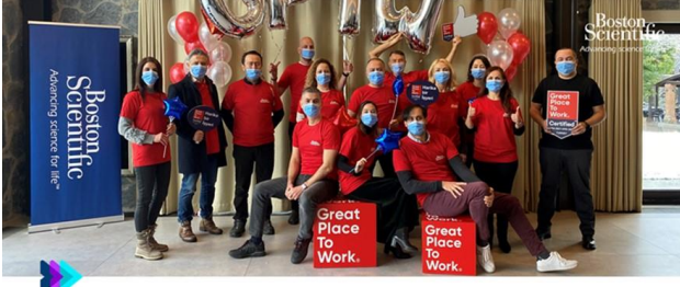
Boston Scientific Turkey certified Great Place to Work 2022