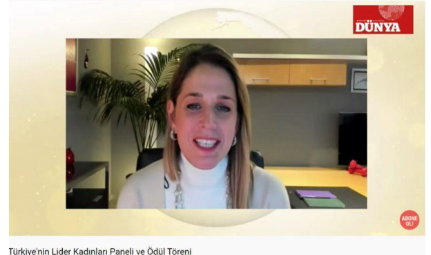
Türkiye'nin Lider Kadınları Paneli ve Ödül Töreni